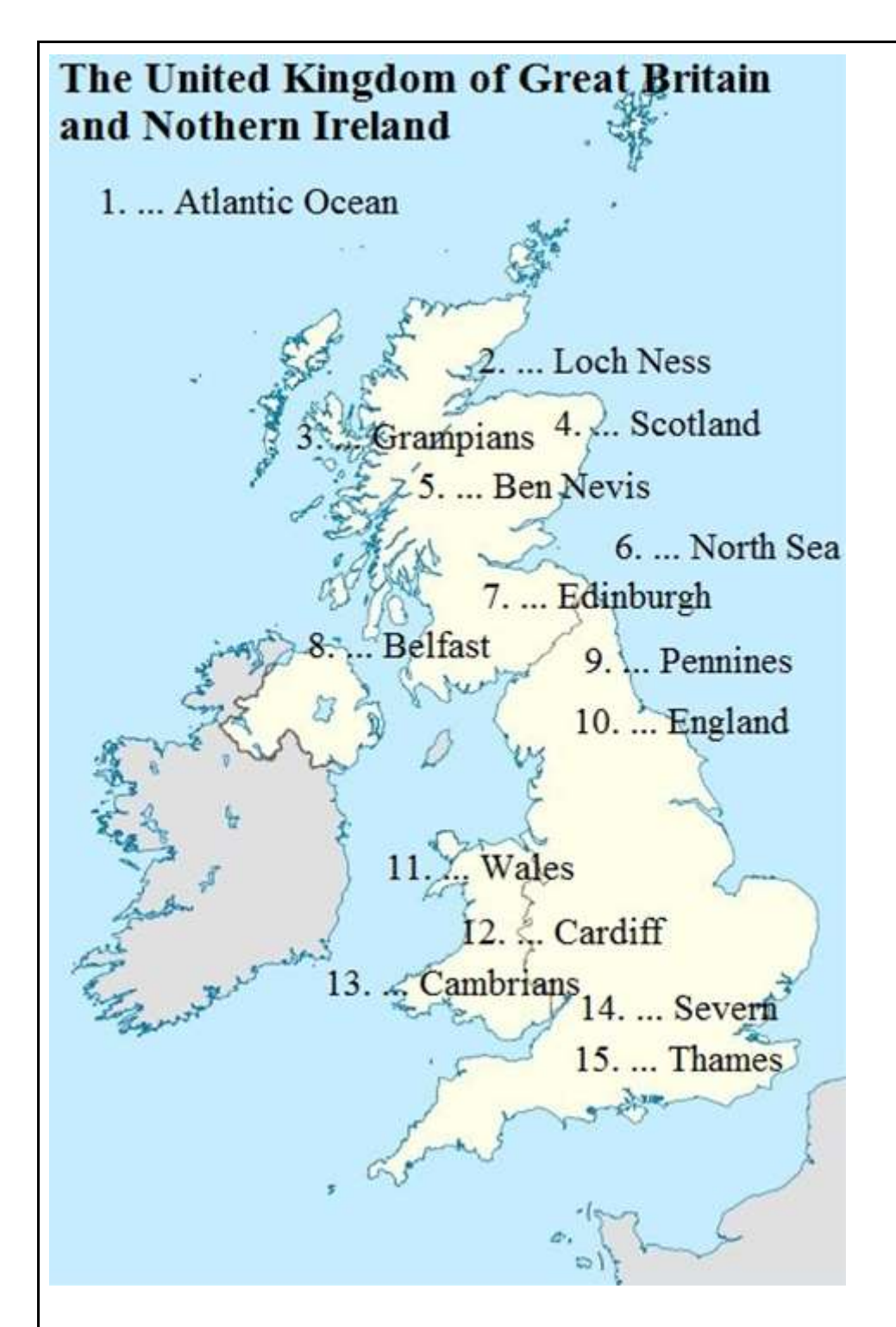
Task 2. Read the text below and fill the spaces in the table with the information from the text.

The Yeoman Warders were formed by King Henry VIII. In 1509 the King decided to leave twelve of his old and sick Yeomen of the Guard in the Tower of London to protect it. Their main duty was to look after the Tower prisoners, and safeguard the British crown jewels.